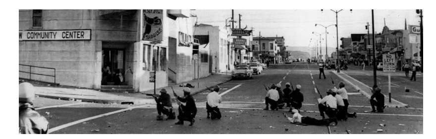
Newcombe and 3<sup>rd</sup> Street, September 28<sup>th</sup>, 1966.