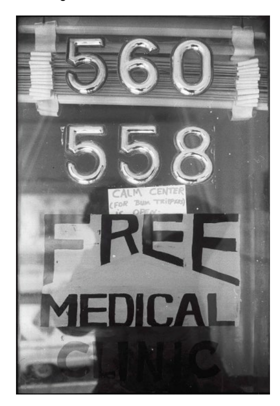
The free medical clinic was opened in June of 1967 in an old dentist's office on Clayton, just off Haight Street.

Bakery, the Free Clinic, the Switchboard, Digger crashpads, street takeovers, weekly free music gatherings in the Panhandle. All the while, Free Food and the Free Store continued serving up "Digger Do," as the Diggers called their action-oriented ideology. Eventually, the combined pressure of the thousands of young people who made the pilgrimage to the Haight-Ashbury that Summer of Love — and at the same time, the relentless arrests and harassment of the Establishment — forced a retreat. Just as the Diggers had jumped off the stage of the Mime Troupe onto the streets to carry out their agit-prop theater, now there was a pulling inward. Hundreds of communes formed in the ensuing months and the action went indoors.