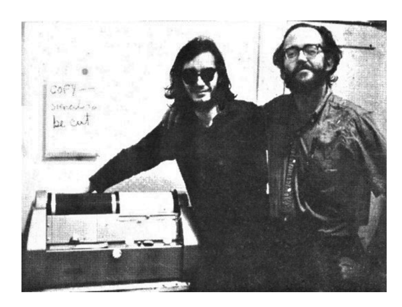
Los Angeles Free Press, 31 March 1967

At the Death of Money Parade in December 1966, two Hells Angels happened upon the street event and joined in. After one of the Diggers rode on the back of an Angel motorcycle and stood waving a sign with the word "NOW" down Haight Street, the police arrested her and the two Hells Angels. The Diggers organized a march to the local police station where they proceeded to raise bail money. In appreciation, the San Francisco chapter of the Hells Angels decided to throw a party for the Diggers. The event was called "New Year's Wail" and it took place on January 1, 1967, in the Panhandle. From that moment on, there was a close relationship between the two groups. At the event, two recent arrivals on the scene took notice of the Digger ethos and became inspired to launch an instant news service for the Haight-Ashbury. They called it the Communication Company.