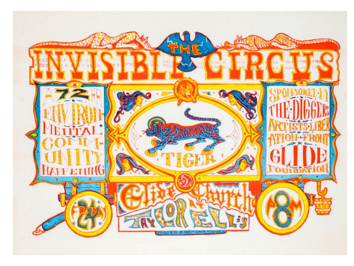
The announcement for one of the Diggers' more (in)famous events, 24 February 1967.

The collective members (there were a total of five) of the Communication Company fashioned themselves the publishing arm of the Diggers. As such, their record of broadsides, manifestos, leaflets and street sheets leaves us a rich slice of Digger praxis as it played out on the streets of the Haight-Ashbury during the spring and summer months of 1967. Many of the 700+ anonymous sheets came from the Diggers themselves; others had been penned by the elder statesman of the Communication Company collective, himself a Beat Movement survivor from North Beach and Greenwich Village who gravitated to the new scene in the Haight. Inspired by the Diggers and their Free philosophy, the Communication Company set up a printing operation with two Gestetner mimeograph machines that had been nefariously obtained through the offices of Ramparts magazine. Everything (or nearly so) was free of charge. If someone heard a rumor of a bust, or had a good lead on free food, or wanted to announce a poetry reading, the Communication Company had roving reporters on the street who could rush at a moment's notice back to the flat where the Gestetners were kept. Within a short time, a new street sheet would appear, distributed by the volunteers who used the street poles as their community bulletin board. 12