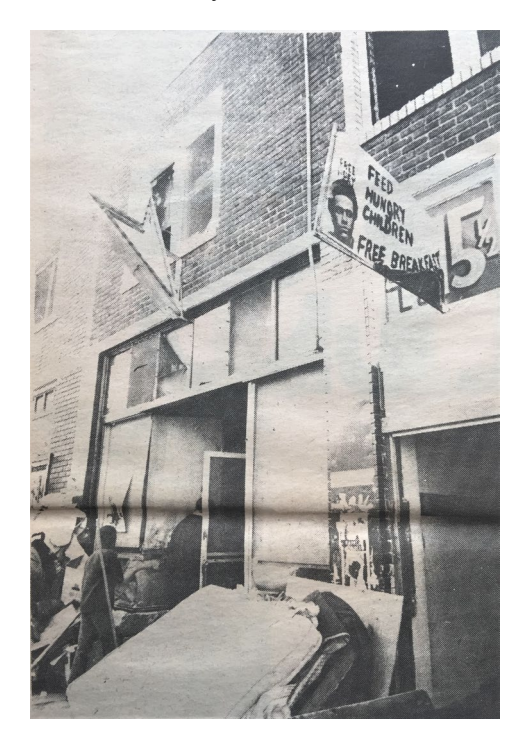
"Free Huey. Feed Hungry Children. Free Breakfast." The FBI's violence against the Black Panther Party focused on community services such as the popular Free Breakfast Program. Above is the Los Angeles Chapter after being destroyed by the police. The Black Panther Black Community News Service 20 December 1967, p. 12.

planted the Com/Co operations. The hard-edge editorials and the black and white productions typical of Com/Co were replaced by a larger (8-1/2" x 14") format, colorful designs, and more poetic pronouncements. The final publication of the Free City Collective was the August 1968 issue of The Realist for which the Diggers were given 40,000 copies of a free edition titled "The Digger Papers"— an anthology of manifestos, street sheets and Free News items that had appeared in the previous eighteen months. Many saw this compilation as the final gift from an amazing collection of individuals and the blueprint for a future collectivity. <sup>15</sup>